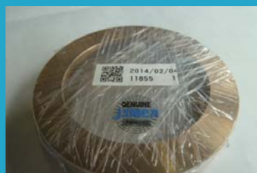
Application on packing material (Pump seal cage)