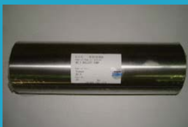
Application on product (Pump sleeve)

As such, the JSMEA has come up with the JSMEA Genuine Product Label. Currently, the label is used by the member companies listed below.