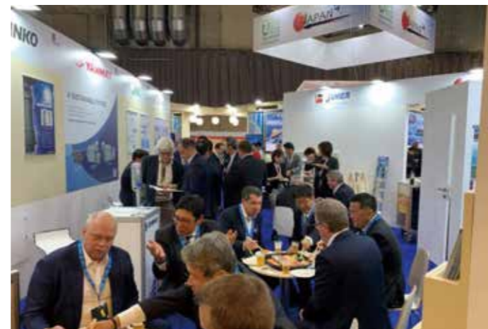
"Japanese Sushi Luncheon Parties" are held at the Japan Pavilion.