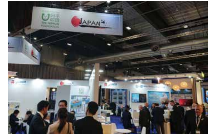
With no separating partitions, the booths at the Japan Pavilion enjoy a sense of unity and openness.