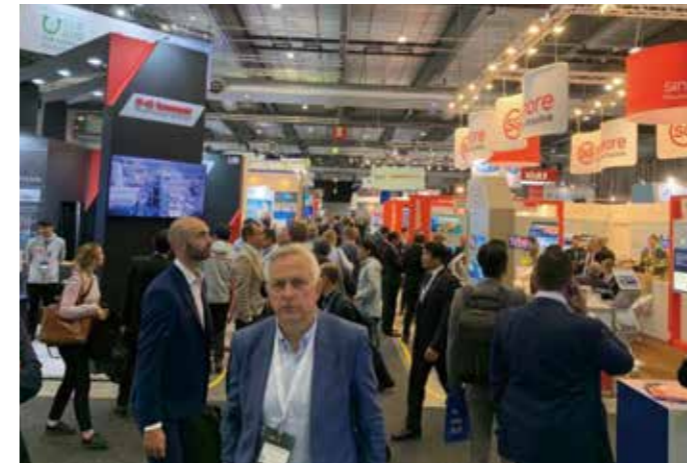
Nor-Shipping 2019 attracts many people.